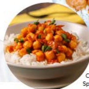
Chickpea & Spinach Curry

Gluten-friendly, vegetarian and other menu options available online!